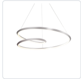
PD22339-BN Brushed Nickel