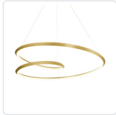
PD22339-BG Brushed Gold